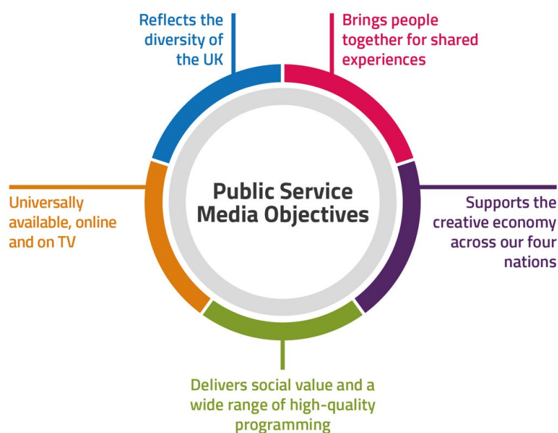
Figure 3: Key elements of the PSM system

4.3 Respondents to our consultation agreed that there was still a clear need for intervention to secure PSM. Some stakeholders considered it was important to define the scope and benefits of a PSM system more clearly. To develop a set of core PSM objectives, we have considered what content is necessary to support a well functioning and informed society.