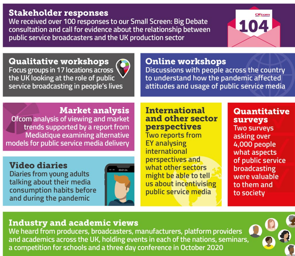
Figure 1: Evidence sources that have informed this review 2